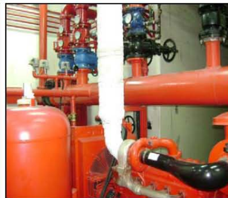
Braided Asbestos Pipe Insulation to Fire Pump Exhaust

Investigation Findings: Whilst carrying out refurbishment works within a commercial property, suspect fibrous materials were encountered during the renovations. Works were stopped after an inspection by the company HSE manager visually identified the fibrous materials. Samples of the suspect materials were collected and analysed by an accredited laboratory, and confirmed the presence of asbestos. Upon return of the sample results a fully intrusive asbestos survey was commissioned.