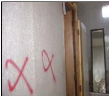
Asbestos Cement Partition Walls