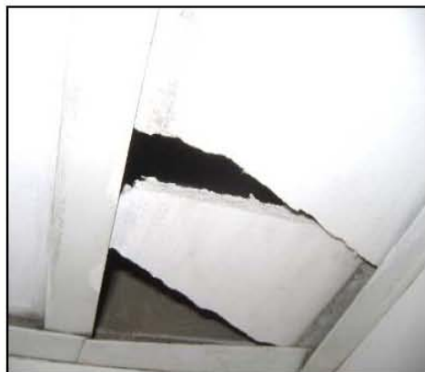
Asbestos Insulating Board Ceiling Tiles

Title: ASBESTOS FOUND DURING REFURBISHMENT